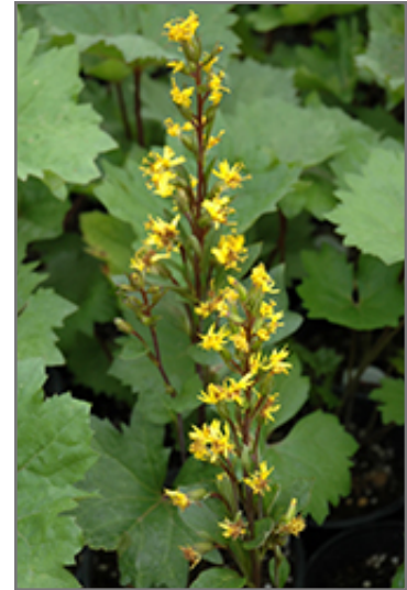
Bottle Rocket Rayflower flowers