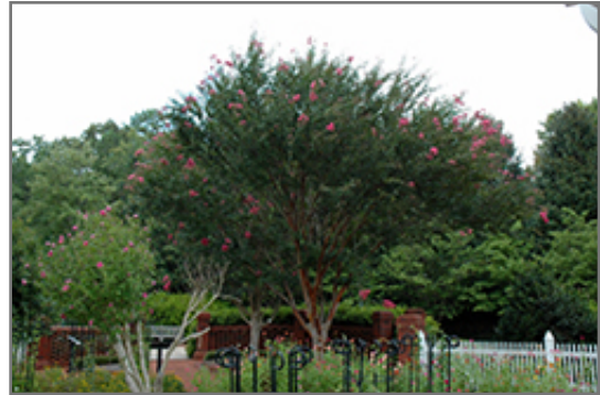
Watermelon Red Crapemyrtle in bloom

This tree does best in full sun to partial shade. It prefers to grow in average to moist conditions, and shouldn't be allowed to dry out. It is very fussy about its soil conditions and must have rich, acidic soils to ensure success, and is subject to chlorosis (yellowing) of the foliage in alkaline soils. It is highly tolerant of urban pollution and will even thrive in inner city environments. This is a selected variety of a species not originally from North America.