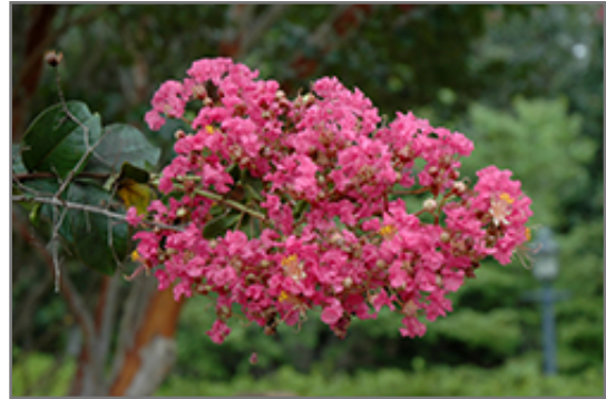
Watermelon Red Crapemyrtle flowers

Watermelon Red Crapemyrtle is recommended for the following landscape applications;