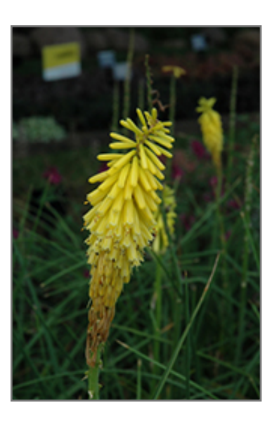
Echo Yellow Torchlily flowers

An outstanding re-blooming variety with elegant yellow blooms, creating an unusual border or container planting; makes a great cutflower and attracts hummingbirds