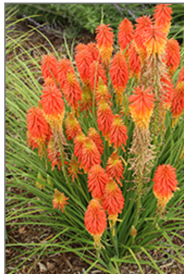
Papaya Popsicle Torchlily in bloom

Papaya Popsicle Torchlily is recommended for the following landscape applications;