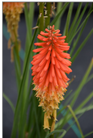
Papaya Popsicle Torchlily flowers