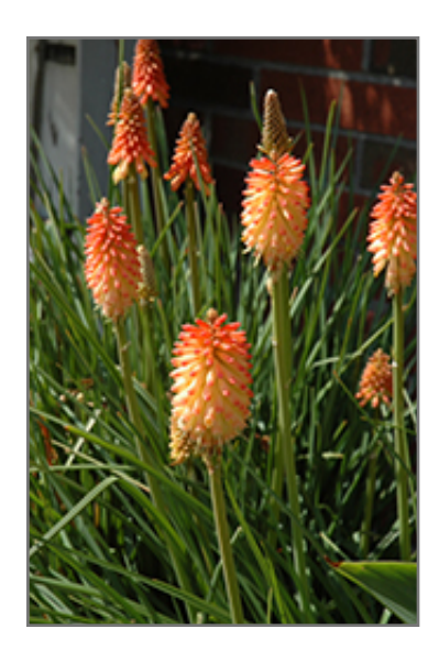
Creamsicle Torchlily flowers