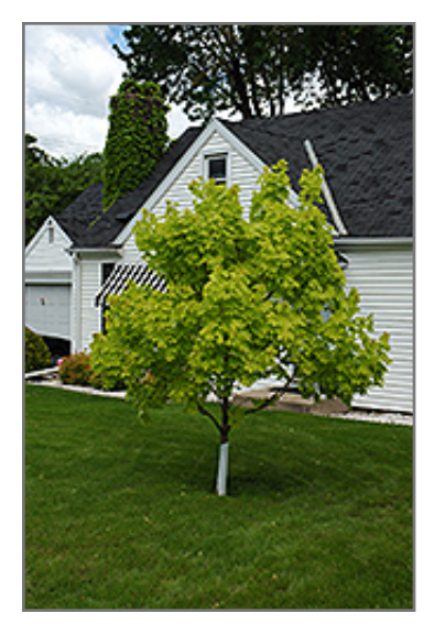
Princeton Gold Maple

Princeton Gold Maple is recommended for the following landscape applications;