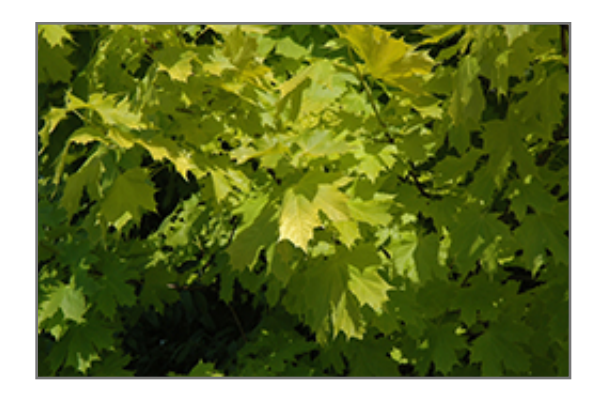
Princeton Gold Maple foliage