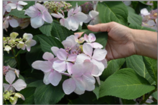
Let's Dance Diva! Hydrangea flowers

Let's Dance Diva! Hydrangea makes a fine choice for the outdoor landscape, but it is also well-suited for use in outdoor pots and containers. Because of its height, it is often used as a 'thriller' in the 'spiller-thriller-filler' container combination; plant it near the center of the pot, surrounded by smaller plants and those that spill over the edges. It is even sizeable enough that it can be grown alone in a suitable container. Note that when grown in a container, it may not perform exactly as indicated on the tag - this is to be expected. Also note that when growing plants in outdoor containers and baskets, they may require more frequent waterings than they would in the yard or garden. Be aware that in our climate, most plants cannot be expected to survive the winter if left in containers outdoors, and this plant is no exception. Contact our experts for more information on how to protect it over the winter months.