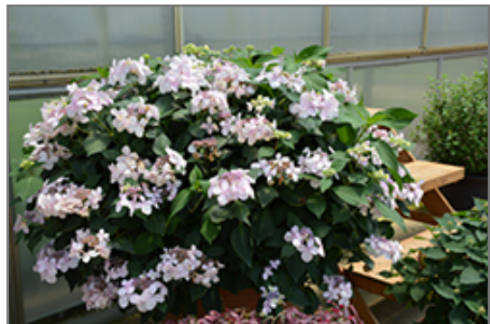
Let's Dance Diva! Hydrangea in bloom