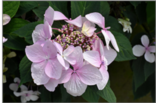
Let's Dance Diva! Hydrangea flowers

Let's Dance Diva! Hydrangea is recommended for the following landscape applications;