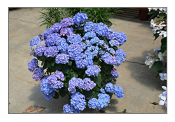
Let's Dance Blue Jangles Hydrangea in bloom