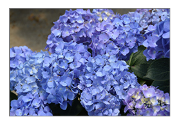
Let's Dance Blue Jangles Hydrangea flowers

Let's Dance Blue Jangles Hydrangea will grow to be about 3 feet tall at maturity, with a spread of 3 feet. It tends to be a little leggy, with a typical clearance of 1 foot from the ground. It grows at a fast rate, and under ideal conditions can be expected to live for approximately 20 years.