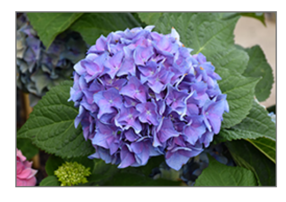
Let's Dance Blue Jangles Hydrangea flowers

Let's Dance Blue Jangles Hydrangea is recommended for the following landscape applications;