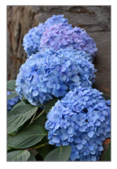
Blue Enchantress Hydrangea flowers