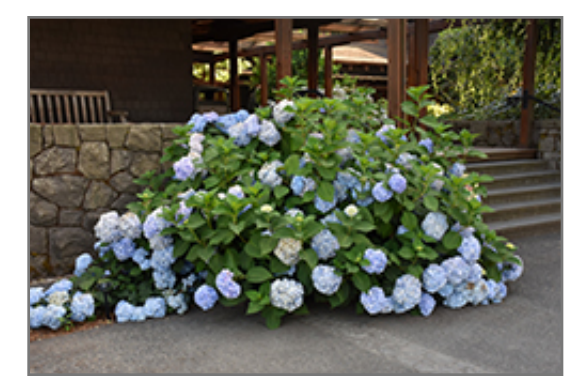
Blue Enchantress Hydrangea in bloom

Blue Enchantress Hydrangea is recommended for the following landscape applications;