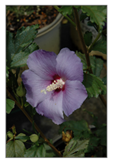
Azurri Blue Satin Rose of Sharon flowers

Extremely showy, large lavender blue flowers with red-purple centers throughout summer; this seedless variety is carefree and easy to grow; a very adaptable plant, but prefers full sun; can be trained into a small tree