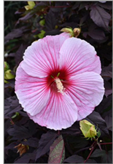
Starry Starry Night Hibiscus flowers

This plant will require occasional maintenance and upkeep, and should be cut back in late fall in preparation for winter. It is a good choice for attracting butterflies and hummingbirds to your yard, but is not particularly attractive to deer who tend to leave it alone in favor of tastier treats. Gardeners should be aware of the following characteristic(s) that may warrant special consideration;