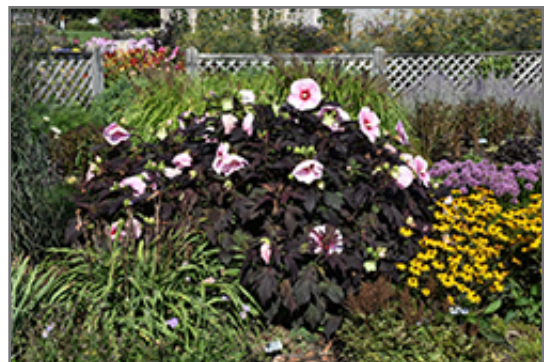
Starry Starry Night Hibiscus in bloom