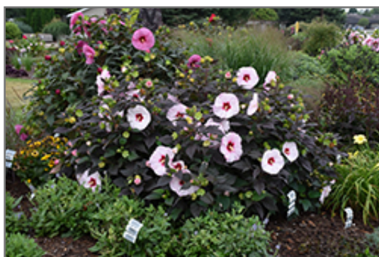
Summerific Perfect Storm Hibiscus in bloom