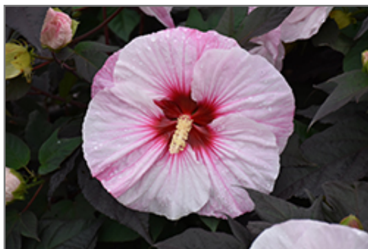
Summerific Perfect Storm Hibiscus flowers

Summerific Perfect Storm Hibiscus is recommended for the following landscape applications;