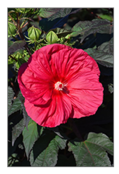
Mars Madness Hibiscus flowers

Mars Madness Hibiscus is an herbaceous perennial with an upright spreading habit of growth. Its relatively coarse texture can be used to stand it apart from other garden plants with finer foliage.