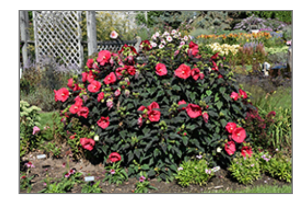
Mars Madness Hibiscus in bloom