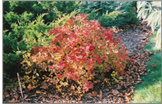
Golden Princess Spirea in fall