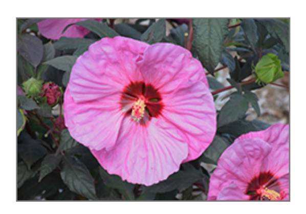
Summerific Berry Awesome Hibiscus flowers