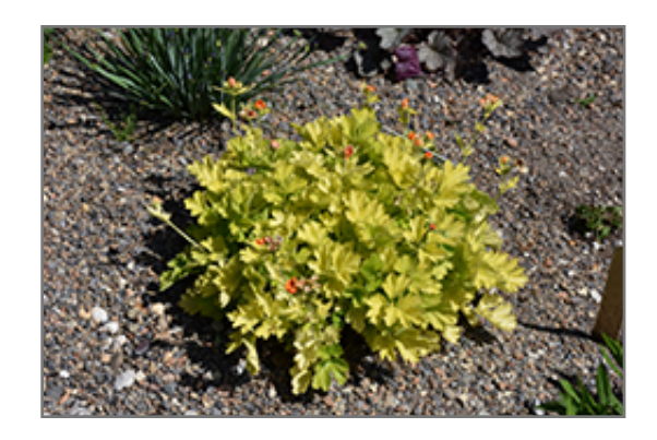
Sunkissed Lime Avens in bloom