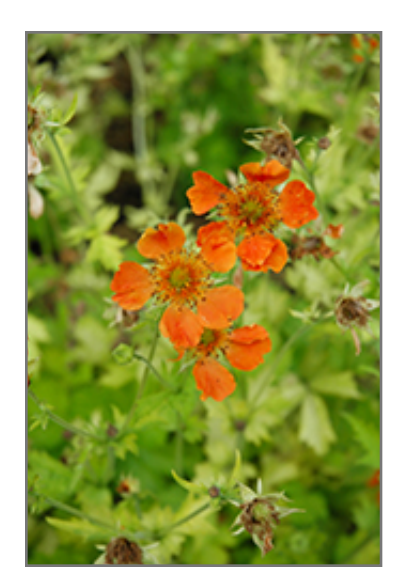
Sunkissed Lime Avens flowers

This is a relatively low maintenance plant, and should be cut back in late fall in preparation for winter. It is a good choice for attracting butterflies to your yard, but is not particularly attractive to deer who tend to leave it alone in favor of tastier treats. It has no significant negative characteristics.