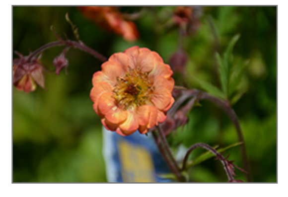
Mai Tai Avens flowers

Mai Tai Avens is recommended for the following landscape applications;