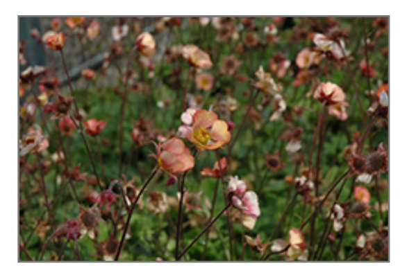
Mai Tai Avens flowers