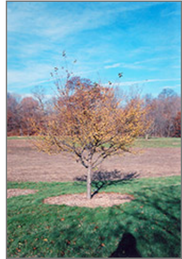
Winter Gold Flowering Crab fruit

Winter Gold Flowering Crab is recommended for the following landscape applications;