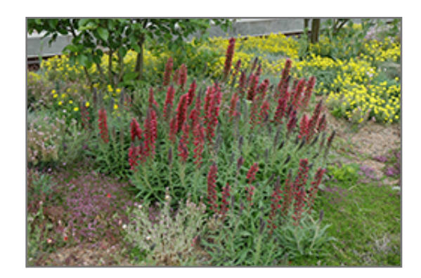
Red Feathers in bloom

This plant will require occasional maintenance and upkeep. Trim off the flower heads after they fade and die to encourage more blooms late into the season. It is a good choice for attracting bees, butterflies and hummingbirds to your yard, but is not particularly attractive to deer who tend to leave it alone in favor of tastier treats. Gardeners should be aware of the following characteristic(s) that may warrant special consideration;