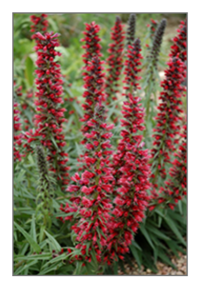
Red Feathers flowers

Red Feathers is an herbaceous evergreen perennial with tall flower stalks held atop a low mound of foliage. Its medium texture blends into the garden, but can always be balanced by a couple of finer or coarser plants for an effective composition.