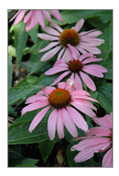
Feeling Pink Coneflower flowers