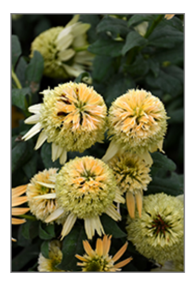
Double Scoop Lemon Cream Coneflower flowers