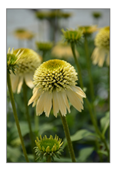
Double Scoop Lemon Cream Coneflower flowers

Double Scoop Lemon Cream Coneflower is recommended for the following landscape applications;