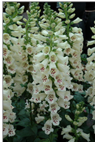
Camelot Cream Foxglove flowers