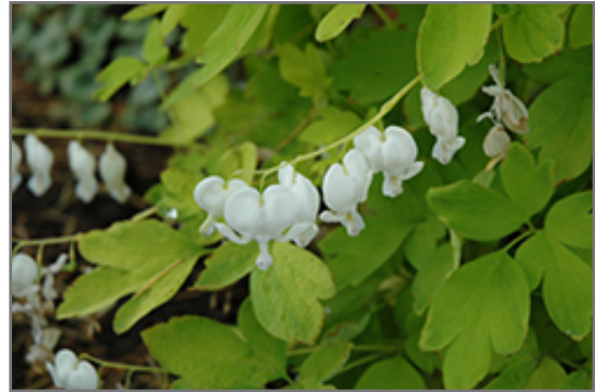
White Gold Bleeding Heart flowers

Other Names: Old Fashioned Bleeding Heart