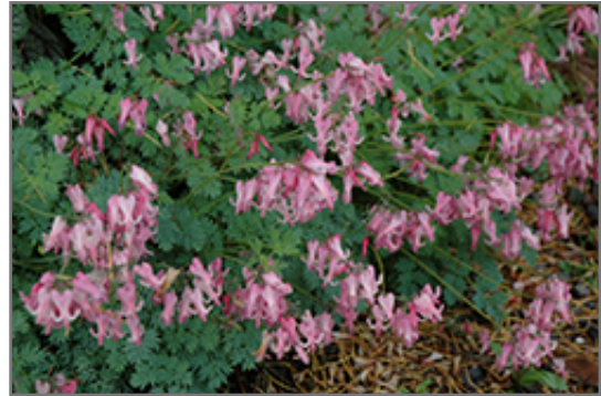
Amore Pink Bleeding Heart in bloom

Amore Pink Bleeding Heart is recommended for the following landscape applications;