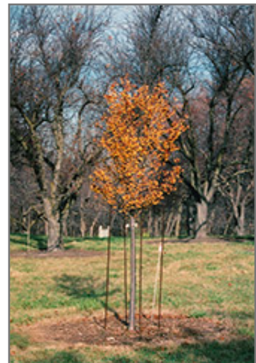
Lancelot Flowering Crab fruit