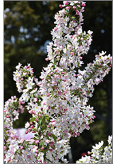
Lancelot Flowering Crab flowers