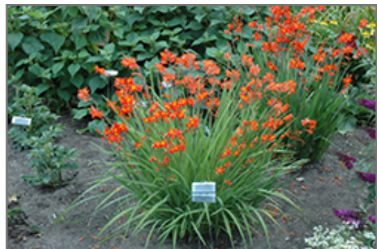
Prince Of Orange Crocosmia in bloom