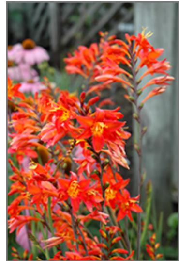
Prince Of Orange Crocosmia flowers

This is a relatively low maintenance plant, and should be cut back in late fall in preparation for winter. It is a good choice for attracting bees, butterflies and hummingbirds to your yard, but is not particularly attractive to deer who tend to leave it alone in favor of tastier treats. It has no significant negative characteristics.