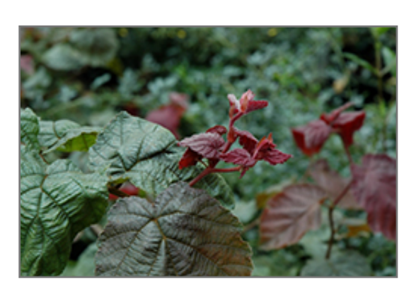
Red Dragon Corkscrew Hazelnut foliage

A phenomenal find with twisted, contorted branch growth and rich burgundy-red foliage; a strong accent in both summer and in winter when the bare branches are at peak visibility; for solitary use only, cut branches are excellent in floral arrangements