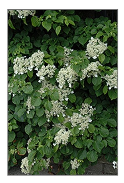
Climbing Hydrangea flowers