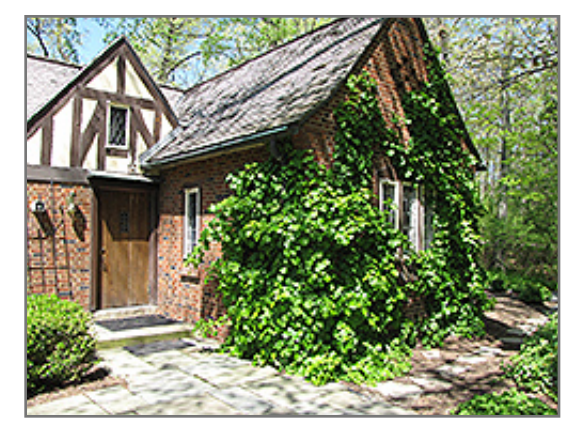
Climbing Hydrangea