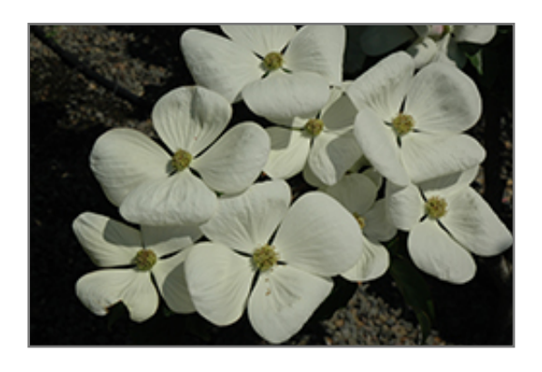
Starlight Flowering Dogwood flowers

A heavily flowering hybrid with striking white blooms that cover it in spring, and foliage that changes to a rich red in the fall; vigorous grower with an erect habit and upright branches makes it a great choice for a front yard accent tree