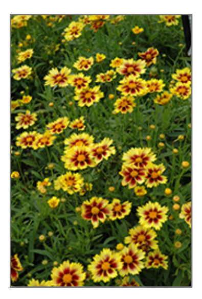
Enchanted Eve Tickseed flowers

This is a relatively low maintenance plant, and is best cleaned up in early spring before it resumes active growth for the season. It is a good choice for attracting butterflies to your yard, but is not particularly attractive to deer who tend to leave it alone in favor of tastier treats. It has no significant negative characteristics.