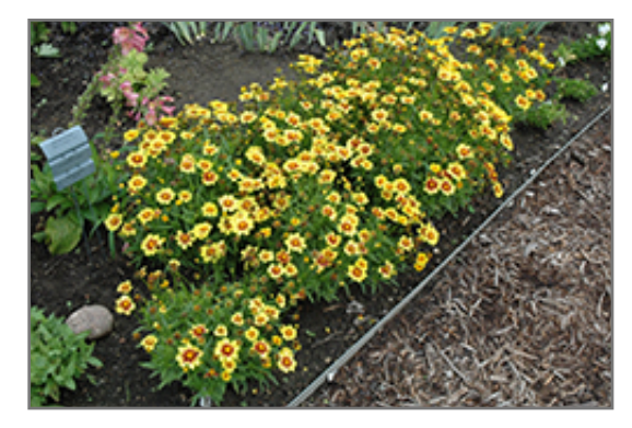
Enchanted Eve Tickseed in bloom

Enchanted Eve Tickseed is recommended for the following landscape applications;