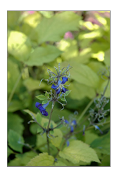
Cassandra Tube Clematis flowers