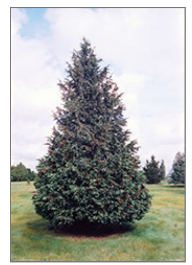
Blue Nootka Cypress

A tall, narrow evergreen with pendulous branches, giving an overall graceful appearance, foliage is a richer blue than the species; a common native west coast tree, ideal for general landscape applications in moist, rainy conditions, but very adaptable