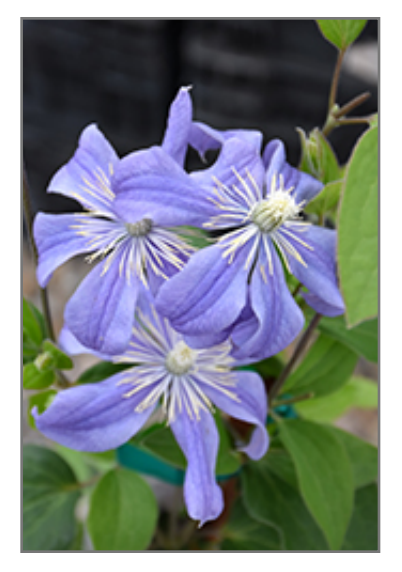
Arabella Clematis flowers

Arabella Clematis features showy lavender star-shaped flowers with blue overtones and white anthers at the ends of the branches from late spring to early fall. It has green deciduous foliage. The compound leaves do not develop any appreciable fall colour.