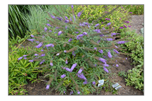
Monarch Blue Knight Butterfly Bush in bloom