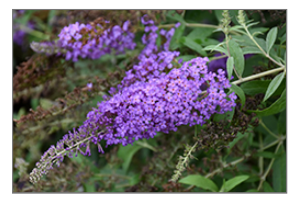
Monarch Blue Knight Butterfly Bush flowers

Monarch Blue Knight Butterfly Bush features showy panicles of fragrant lavender flowers with purple overtones at the ends of the branches from mid summer to early fall, which emerge from distinctive deep purple flower buds. The flowers are excellent for cutting. It has attractive bluish-green deciduous foliage. The narrow leaves are highly ornamental but do not develop any appreciable fall colour.