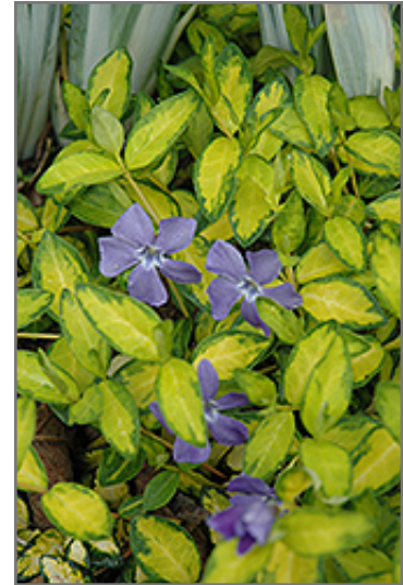
Illumination Periwinkle flowers

Illumination Periwinkle is a fine choice for the garden, but it is also a good selection for planting in outdoor pots and containers. Because of its spreading habit of growth, it is ideally suited for use as a 'spiller' in the 'spiller-thriller-filler' container combination; plant it near the edges where it can spill gracefully over the pot. Note that when growing plants in outdoor containers and baskets, they may require more frequent waterings than they would in the yard or garden. Be aware that in our climate, most plants cannot be expected to survive the winter if left in containers outdoors, and this plant is no exception. Contact our experts for more information on how to protect it over the winter months.