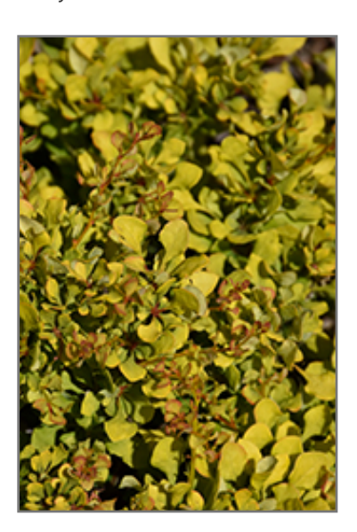
First Editions Daybreak Japanese Barberry foliage

First Editions Daybreak Japanese Barberry is recommended for the following landscape applications;