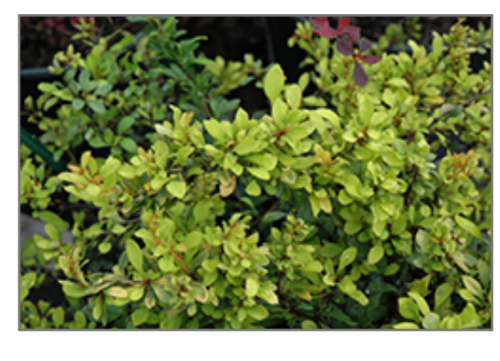
First Editions Daybreak Japanese Barberry foliage