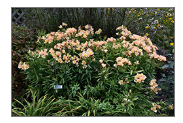
Inca Ice Alstroemeria in bloom

This is a relatively low maintenance plant, and usually looks its best without pruning, although it will tolerate pruning. It is a good choice for attracting bees, butterflies and hummingbirds to your yard. It has no significant negative characteristics.