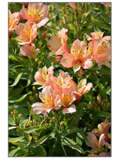
Inca Ice Alstroemeria flowers

Inca Ice Alstroemeria is an herbaceous perennial with a mounded form. Its medium texture blends into the garden, but can always be balanced by a couple of finer or coarser plants for an effective composition.