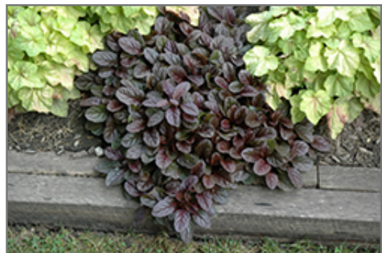
Mahogany Bugleweed