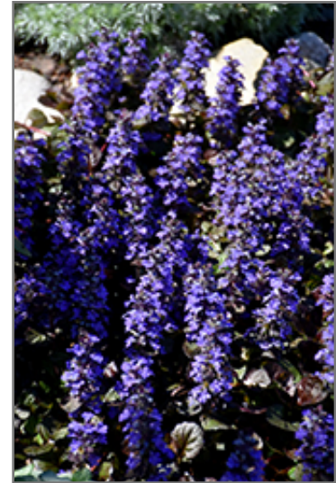
Mahogany Bugleweed flowers

This plant does best in partial shade to shade. It does best in average to evenly moist conditions, but will not tolerate standing water. It is not particular as to soil type or pH. It is somewhat tolerant of urban pollution. Consider covering it with a thick layer of mulch in winter to protect it in exposed locations or colder microclimates. This is a selected variety of a species not originally from North America. It can be propagated by division; however, as a cultivated variety, be aware that it may be subject to certain restrictions or prohibitions on propagation.