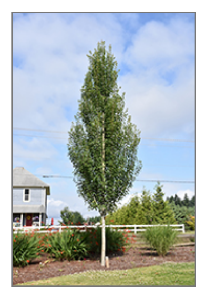
Armstrong Gold Red Maple