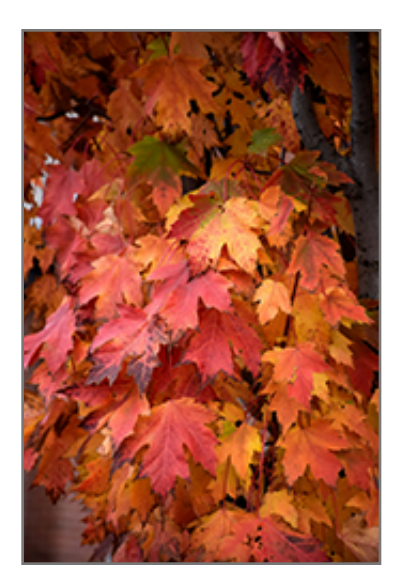
Armstrong Gold Red Maple in fall