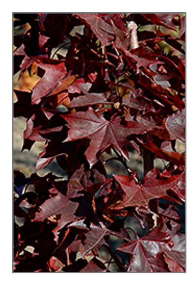
Crimson Sunset Maple foliage