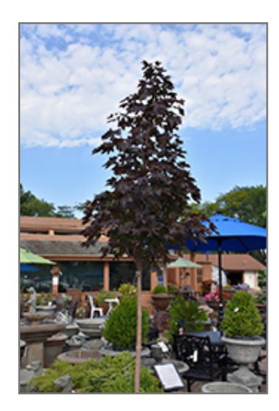
Crimson Sunset Maple