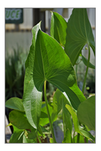
Broadleaf Arrowhead foliage