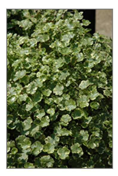
Variegated Pennywort foliage