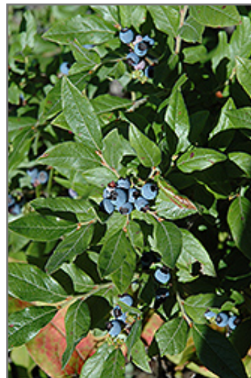
Lowbush Blueberry fruit

Lowbush Blueberry features dainty clusters of white bell-shaped flowers with shell pink overtones hanging below the branches in mid spring. It has dark green deciduous foliage. The oval leaves turn an outstanding scarlet in the fall. It features an abundance of magnificent blue berries in mid summer.