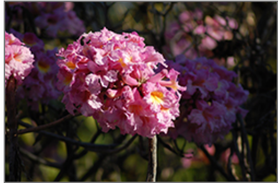
Pink Trumpet Tree flowers

Pink Trumpet Tree is recommended for the following landscape applications;