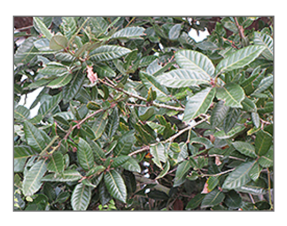
Island Oak foliage

A conical evergreen tree when young that takes on a broader mature form; attractive foliage is leathery, dark green and glossy, with blue-green undersides; suitable as a windbreak or large screen, making it valuable in urban and garden settings