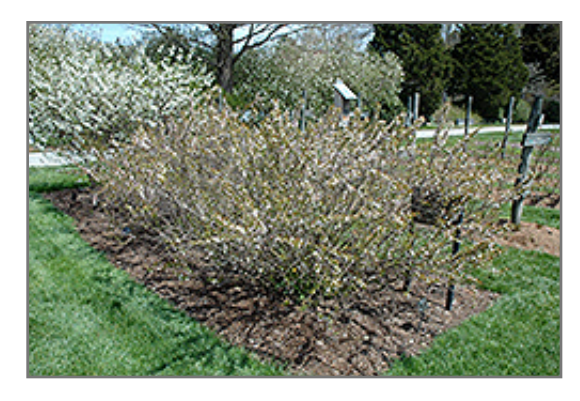
Joy Bush Cherry in bloom