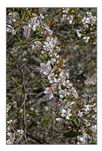
Joy Bush Cherry flowers

Joy Bush Cherry is covered in stunning fragrant white flowers with hot pink eyes along the branches in early spring before the leaves. It has green deciduous foliage which emerges brick red in spring. The pointy leaves turn an outstanding yellow in the fall. The fruits are showy red drupes carried in abundance from mid to late summer.