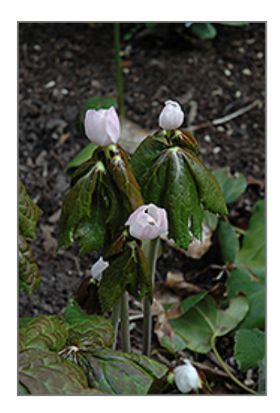
Himalayan Mayapple flowers

A wonderful clumping variety with large lobed umbrella shaped leaves that emerge burgundy-copper and mature to dark green; lovely, upward facing pale pink flowers in spring; protect from spring frosts in colder areas