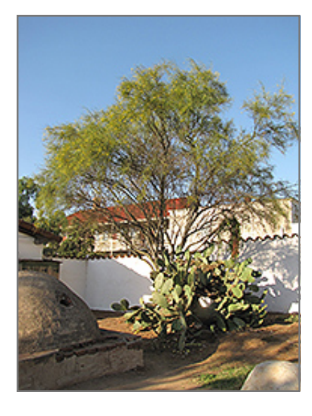
Mexican Palo Verde in bloom