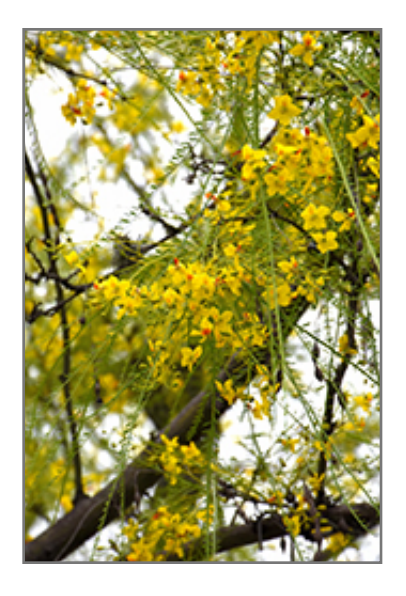
Mexican Palo Verde flowers