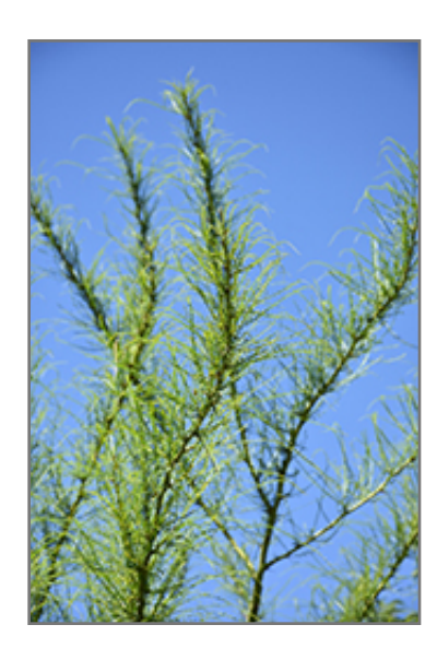
Mexican Palo Verde foliage

This tree does best in full sun to partial shade. It prefers dry to average moisture levels with very well-drained soil, and will often die in standing water. It is considered to be drought-tolerant, and thus makes an ideal choice for xeriscaping or the moisture-conserving landscape. It is not particular as to soil type or pH. It is somewhat tolerant of urban pollution. This species is native to parts of North America.