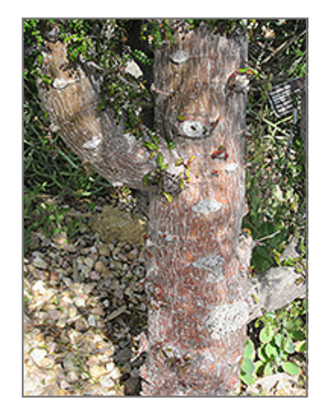
Elephant Tree bark