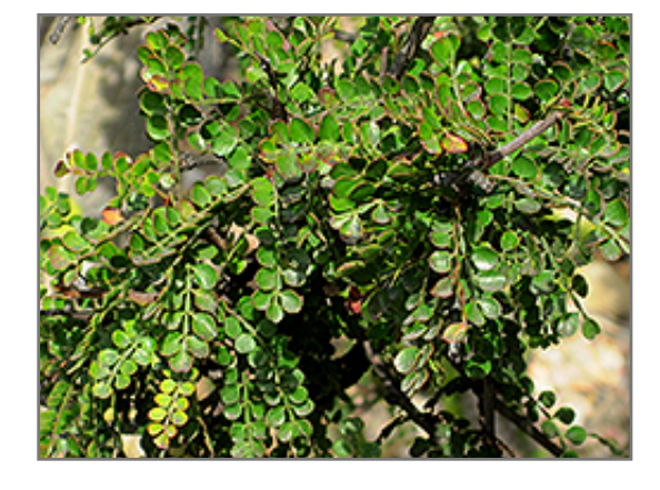
Elephant Tree foliage

Elephant Tree is recommended for the following landscape applications;