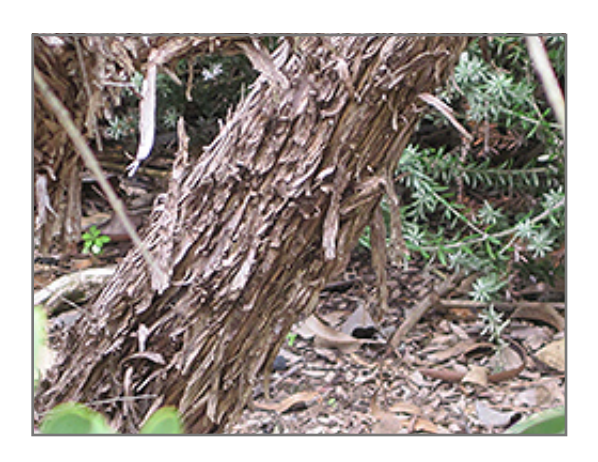
Australian Tea-Tree bark

This is a relatively low maintenance tree, and should only be pruned after flowering to avoid removing any of the current season's flowers. Deer don't particularly care for this plant and will usually leave it alone in favor of tastier treats. It has no significant negative characteristics.