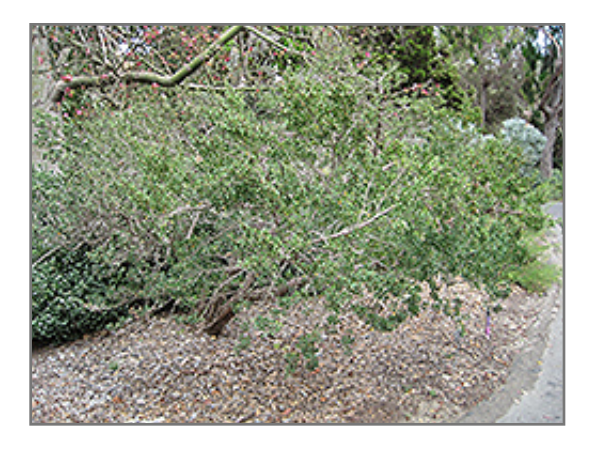
Australian Tea-Tree

Australian Tea-Tree is a dense multi-stemmed evergreen tree with an upright spreading habit of growth. Its relatively fine texture sets it apart from other landscape plants with less refined foliage.